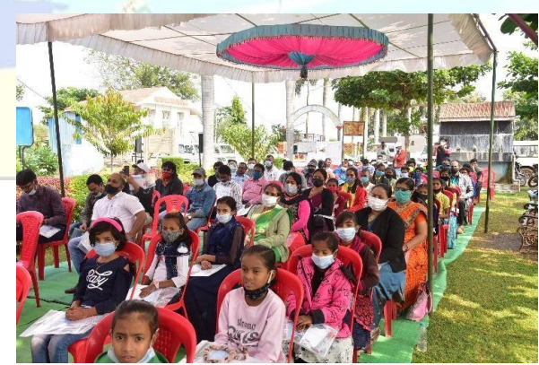
क्षेत्रीय निदेशक महोदय का जल संरक्षण एवं कुंडी भंडारा पर तकनीकी संबोधन