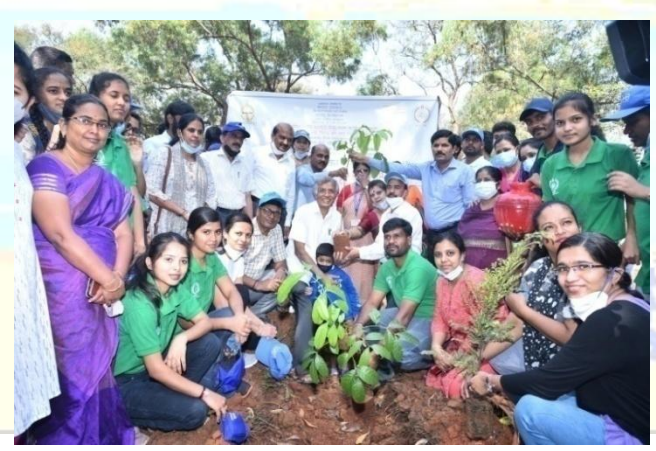
Participants of afforestation activity