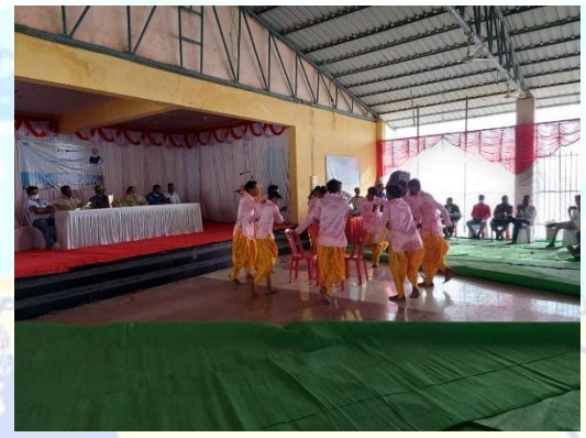
Panthi Nritya in Nadi Utsav at Seorinarayan, Janjgir Champa, Chhattisgarh