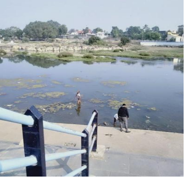
Before the cleanliness drive at Dham river