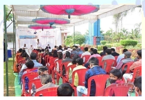
जागरूकता कार्यक्रम के दौरान कमिश्नर नगर निगम का सम्बोधन

आज दिनांक 17.12.2021 को आजादी के अमृत महोत्सव के अंतर्गत रिवर उत्सव के दौरान केंद्रीय भूमि जल बोर्ड उत्तर मध्य क्षेत्र भोपाल की ओर से बुरहानपुर में जल संरक्षण एवं कुंडी भंडारा पर जागरूकता कार्यक्रम का आयोजन किया गया उक्त कार्यक्रम में नगर निगम, पीएचई डिपार्टमेंट, स्कूल के बच्चों, एनजीओ एवं स्थानीय नागरिकों ने प्रतिभाग किया इस कार्यक्रम में कुल 100 प्रतिभागियों ने प्रतिभाग किया जिसमें 15 महिलाएं और 85 पुरुष थे।