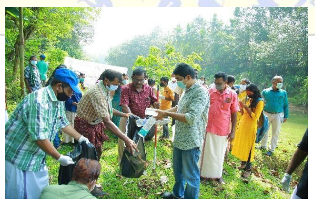
Students and local public actively participated in the River cleaning campaign along the banks of Neyyar river