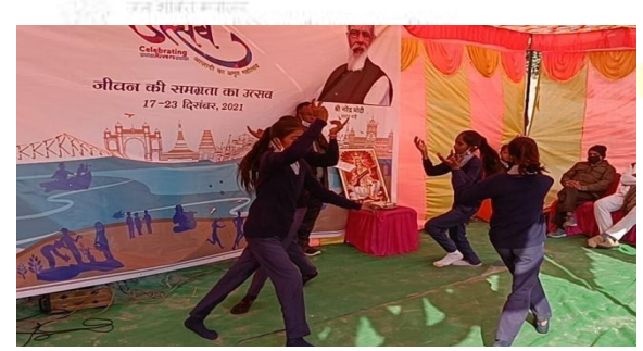
Cultural activities by the students