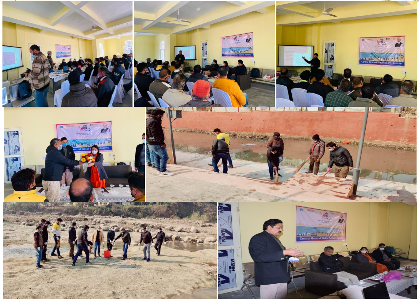
Glimpses of the various events organized under Nadi Utsav by CGWB- Jammu

The officers and officials of CGWB, Jammu also participated in the cleanliness drive in Devika River & Celebrating River a tributary of Tawi river.