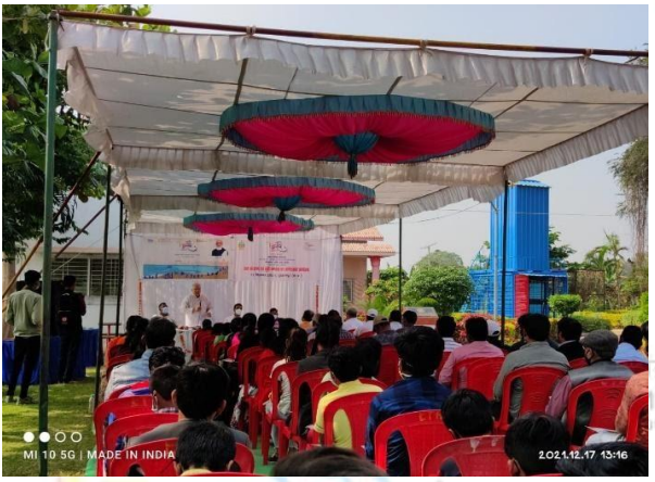
स्कृति मंत्रालय INISTRY OF CULT VERNMENT OF INDIA