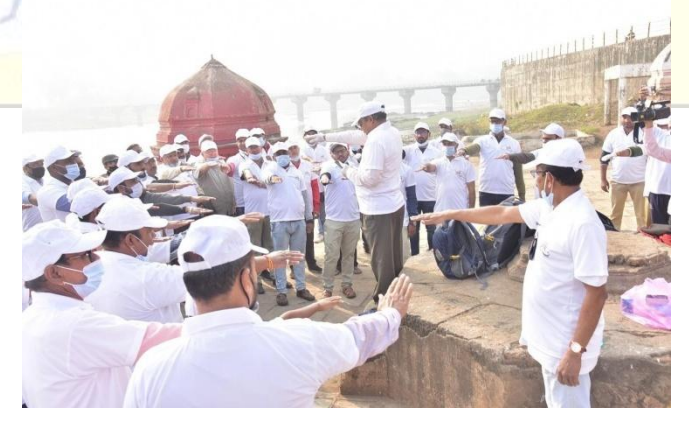
ताप्ती नदी को स्वच्छ रखने के लिए शपथ लेते हुए

आजादी का अमृत महोत्सव के अंतर्गत नदी उत्सव के दौरान आज दिनांक 17 दिसंबर 2021 को राजघाट ताप्ती नदी के किनारे बुरहानपुर पर स्वच्छता अभियान का आयोजन किया गया जिसमें स्थानीय नागरिक स्वयंसेवी संस्थाएं केंद्रीय भूमि जल बोर्ड के अधिकारी एवं कर्मचारी नगर निगम बुरहानपुर के अधिकारी एवं कर्मचारियों ने अपना श्रमदान दिया उक्त कार्यक्रम में नगर निगम, पीएचई डिपार्टमेंट, एनजीओ एवं स्थानीय नागरिकों ने प्रतिभाग किया इस कार्यक्रम में कुल 70 प्रतिभागियों ने प्रतिभाग किया जिसमें 5 महिलाएं और 65 पुरुष थे।