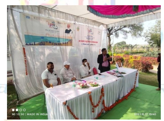
कार्यक्रम में में उपस्थित छात्र छात्राओं द्वारा संवाद