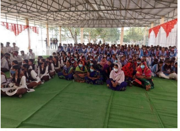
Participants in Nadi Utsav at Seorinarayan, Janjgir Champa, Chhattisgarh