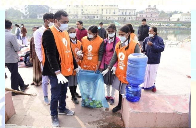
कार्यक्रम के दौरान सूखे कचरे की सफाई