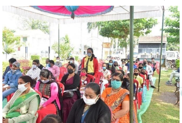
कार्यक्रम में उपस्थित प्रतिभागी