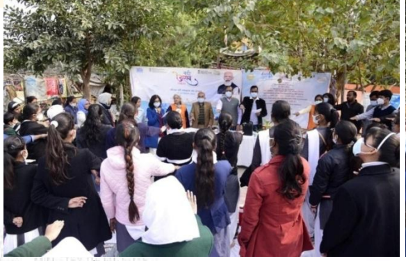
नदी संरक्षण पर शपथ ग्रहण