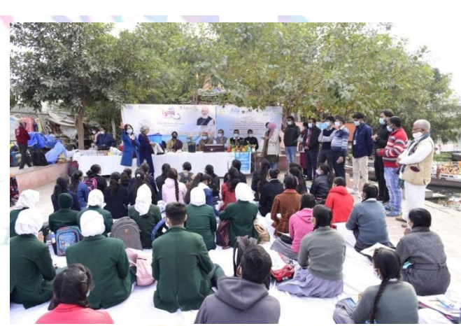
नदी उत्सव समारोह