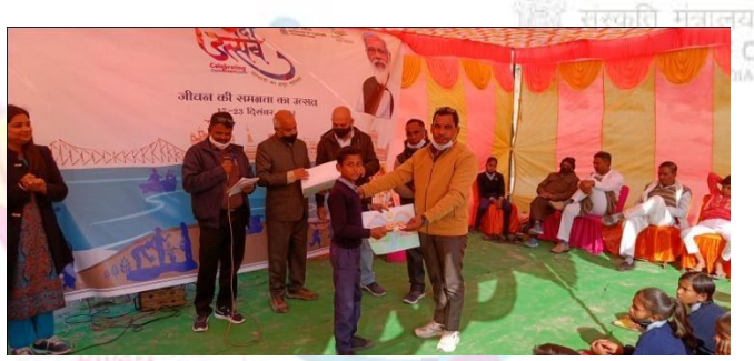
Prize distribution among the students