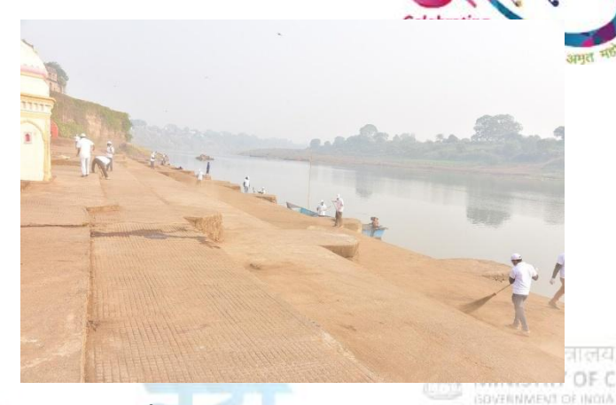
<sup>ाराचा इ.च.५</sup>०० काणा ताप्ती नदी के कि<mark>नारे राजघाट</mark> पर श्रमदान करते हुए