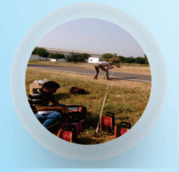
Resistivity survey for site selection at Army Station at Talbehat, Bundelkhand