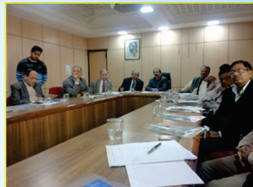
Deliberations on Aquifer Maps and Management plans during NLEC meeting held on 5 th Dec 2018 at Bhujal Bhawan, Faridabad