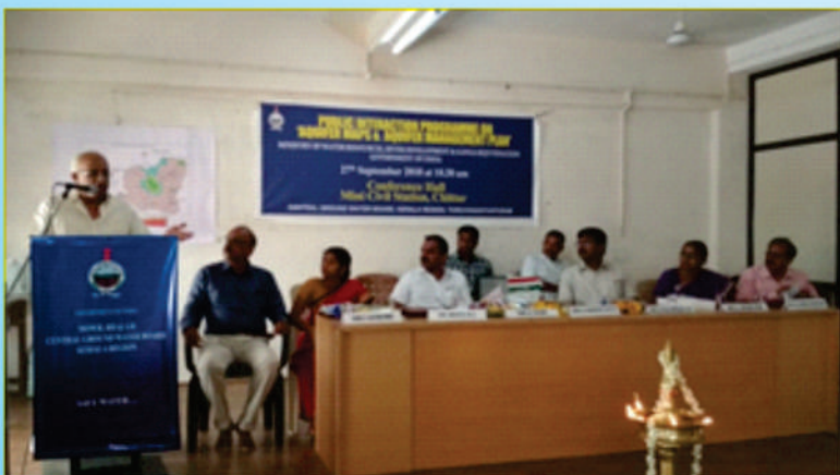
PIP on Aquifer Maps and Management Plan at Chittur, Palakkad District, Kerala