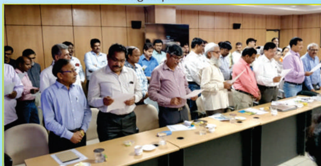
Officers of CGWB taking oath during Vigilance Awareness Week