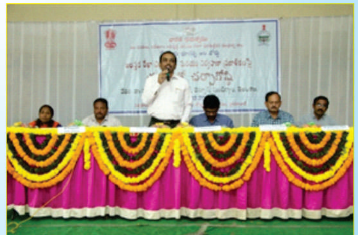
PIP on Aquifer map and Management Plan held at shahapur taluk, Karnataka on 27 th Sept. 2018