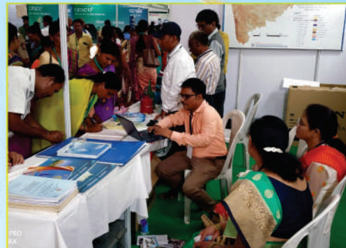
Officers of CGWB, Nagpur interacting with Visitors