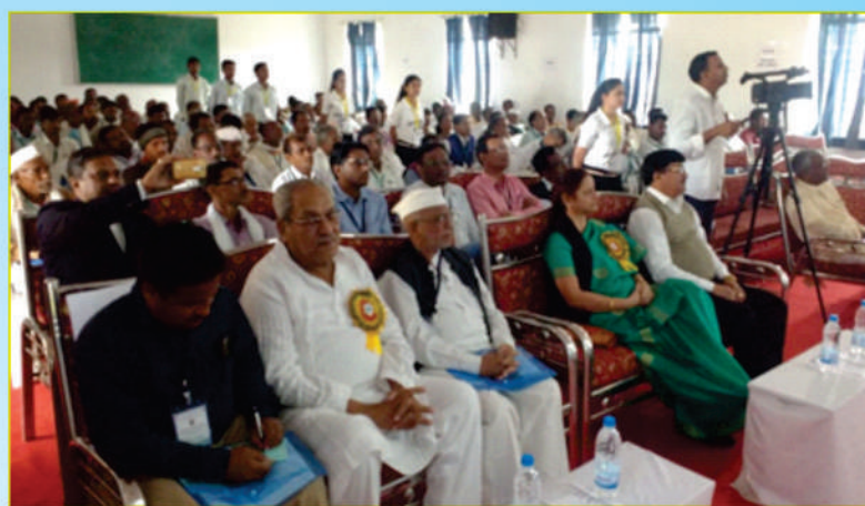
Workshop on "Rainwater Harvesting & Groundwater Management" at Gadchiroli District, Maharashtra