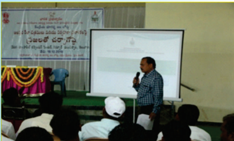
Public Interaction Programme(PIP) "Aquifer Map and Management Plans of Chennur Mandal, Adilabad district, Andhra Pradesh" held at Chennur on 19.12.2018