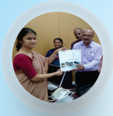
Secretary Water Resources, Kerala releasing the reports on "Impact of Kerala flood on Ground Water Resources in Periyar basin and Pampa basin at Secretariat Trivandrum" prepared by CGWB Kerala