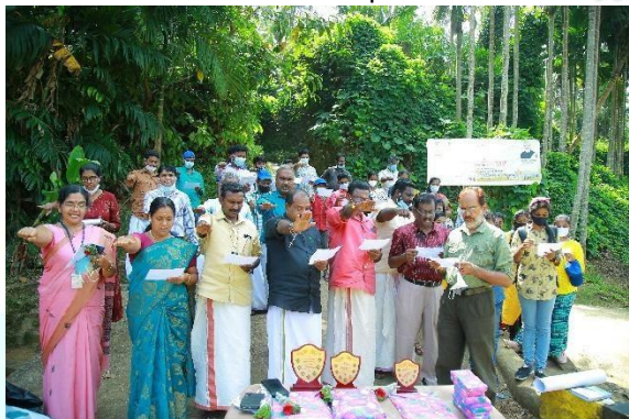
Pledge taking ceremony held during river cleaning campaign on 23.12.2021