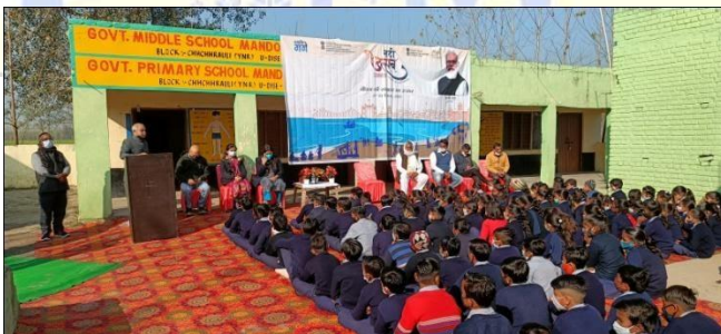
Opening Remarks at Govt Middle School Mandoli Gaggad

Some of the Photographs of the Nadi Utsav event are as below.