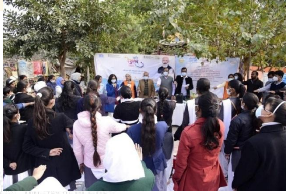
नदी संरक्षण पर शपथ ग्रहण MINISTRY OF WATER RESOURCES, RIVER DEVELOPMENT & GANGA REJUVENATION