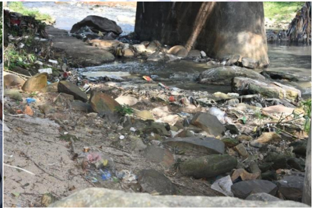
View of Visrabhavathi river bank before cleaning