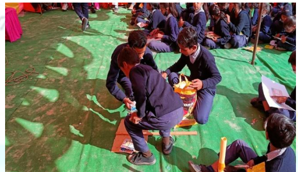
Shram Daan (Cleanliness)