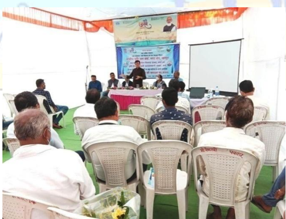
Regional Director, CGWB, CR, Nagpur, adress to the village on Nadi Utasav