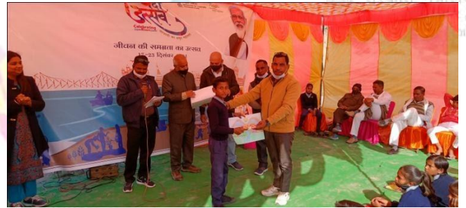
Prize distribution among the students