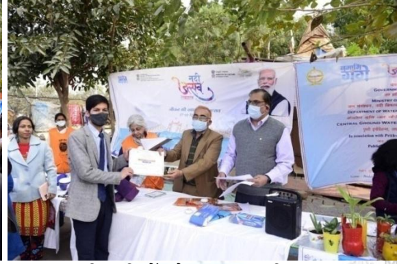
प्रतिभागियों को प्रमाण पत्र वितरण क्रीडा मंत्रालय MINISTRY OF CULTURE GOVERNMENT OF INDIA