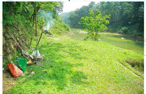
Views of Neyyar river bank at Kallikkadu grama panchayath after River cleaning campaign held on 23.12.2021