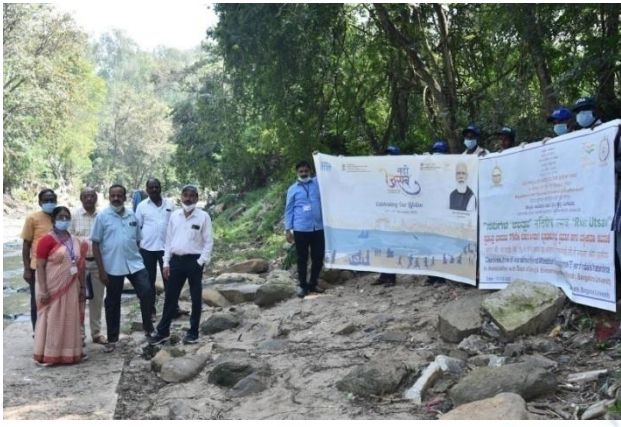
View after Shramdaan activity

जल संचयन विभाग नदी विकास और जल संचयन MINISTRY OF WATER RESOURCES DEPARTMENT OF WATER RESOURCES RIVER DEVELOPMENT & GANGA REJUVENATION