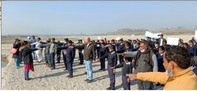
Pledge by the students, faculty and Officers from CGWB NWR