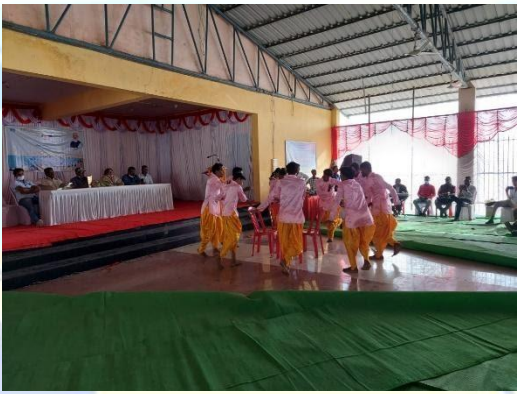
Panthi Nritya in Nadi Utsav at Seorinarayan, Janjgir Champa, Chhattisgarh