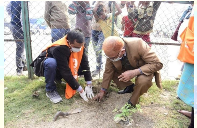
कार्यालय प्रमुख द्वारा पौधारोपण