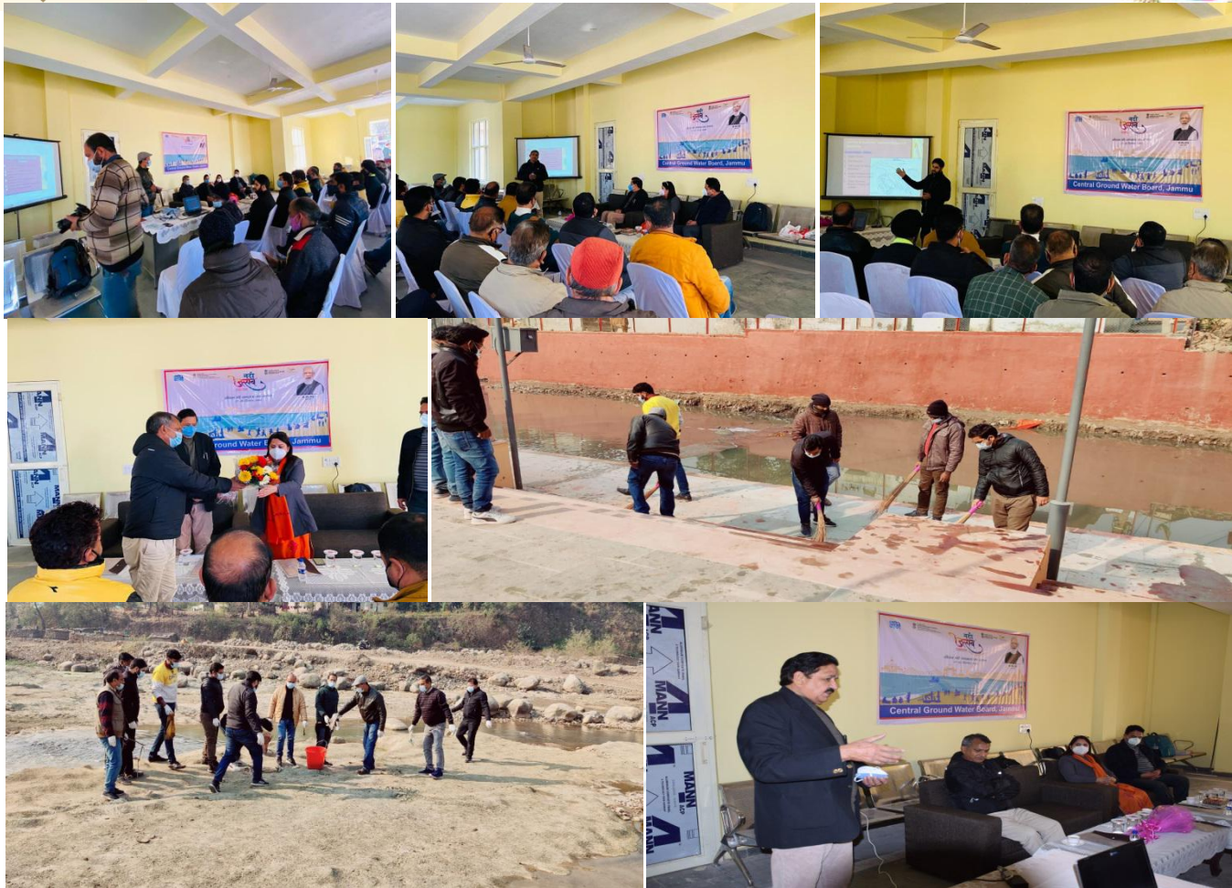
Glimpses of the various events organized under Nadi Utsav by CGWB- Jammu

The officers and officials of CGWB, Jammu also participated in the cleanliness drive in Devika River & Birma River a tributary of Tawi river.