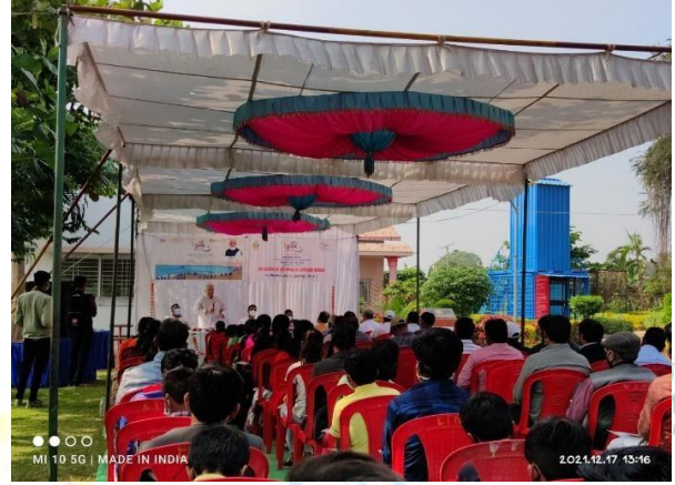
कार्यक्रम में उपस्थित प्रतिभागी