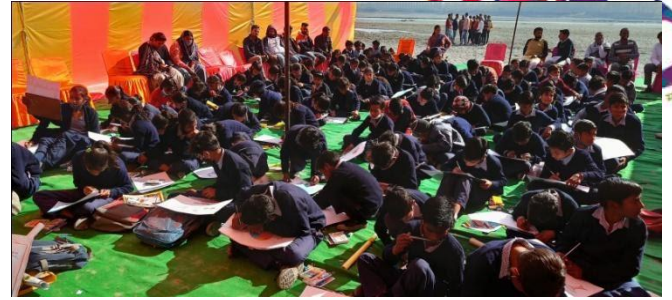
Painting competition by the students