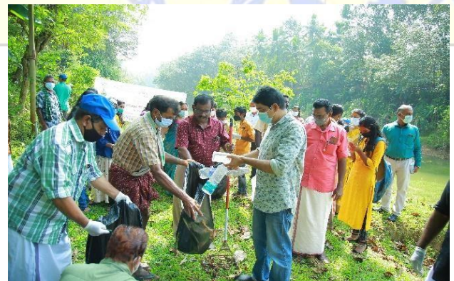
Students and local public actively participated in the River cleaning campaign along the banks of Neyyar river