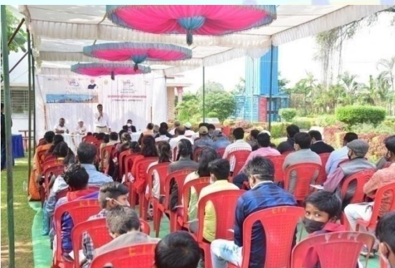
जागरूकता कार्यक्रम के दौरान कमिश्नर नगर निगम का सम्बोधन

आज दिनांक 17.12.2021 को आजादी के अमृत महोत्सव के अंतर्गत रिवर उत्सव के दौरान केंद्रीय भूमि जल बोर्ड उत्तर मध्य क्षेत्र भोपाल की ओर से बुरहानपुर में जल संरक्षण एवं कुंडी भंडारा पर जागरूकता कार्यक्रम का आयोजन किया गया उक्त कार्यक्रम में नगर निगम, पीएचई डिपार्टमेंट, स्कूल के बच्चों, एनजीओ एवं स्थानीय नागरिकों ने प्रतिभाग किया इस कार्यक्रम में कुल 100 प्रतिभागियों ने प्रतिभाग किया जिसमें 15 महिलाएं और 85 पुरुष थे।