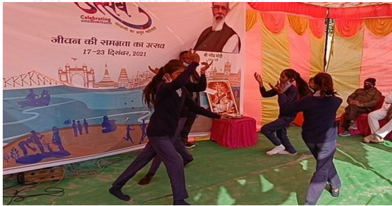
Cultural activities by the students