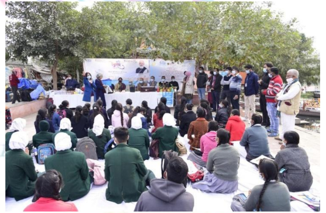
नदी उत्सव समारोह