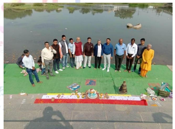
NGO and Officers of CGWB present during the Nadi puja.