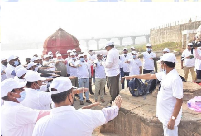
ताप्ती नदी को स्वच्छ रखने के लिए शपथ लेते हुए

आजादी का अमृत महोत्सव के अंतर्गत नदी उत्सव के दौरान आज दिनांक 17 दिसंबर 2021 को राजघाट ताप्ती नदी के किनारे बुरहानपुर पर स्वच्छता अभियान का आयोजन किया गया जिसमें स्थानीय नागरिक स्वयंसेवी संस्थाएं केंद्रीय भूमि जल बोर्ड के अधिकारी एवं कर्मचारी नगर निगम बुरहानपुर के अधिकारी एवं कर्मचारियों ने अपना श्रमदान दिया उक्त कार्यक्रम में नगर निगम, पीएचई डिपार्टमेंट, एनजीओ एवं स्थानीय नागरिकों ने प्रतिभाग किया इस कार्यक्रम में कुल 70 प्रतिभागियों ने प्रतिभाग किया जिसमें 5 महिलाएं और 65 पुरुष थे।