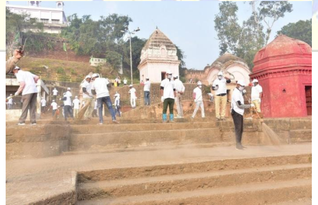
ताप्ती नदी के किनारे राजघाट पर श्रमदान करते हुए