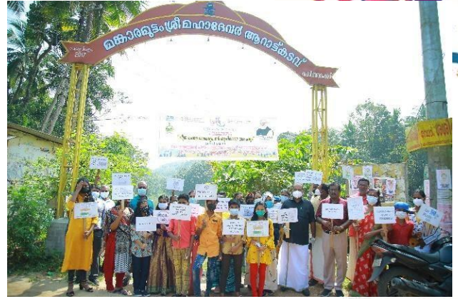
View of public rally conducted as part of river cleaning campaign held on 23.12.2021