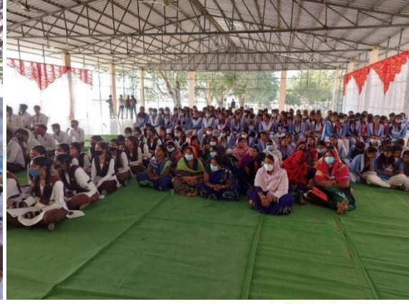
Participants in Nadi Utsav at Seorinarayan, Janjgir Champa, Chhattisgarh