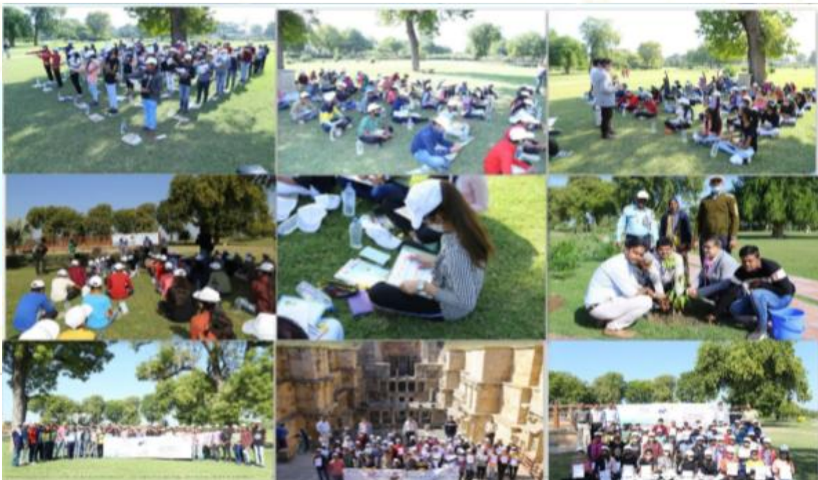
Glimpses of various activities organized during Nadi Utsav program at Patan, Gujarat on 21.12.2021

At the end, a foot march along the “Rani Ki Vav” was conducted to sensitize the participants on celebration of “Nadi Utsav”.