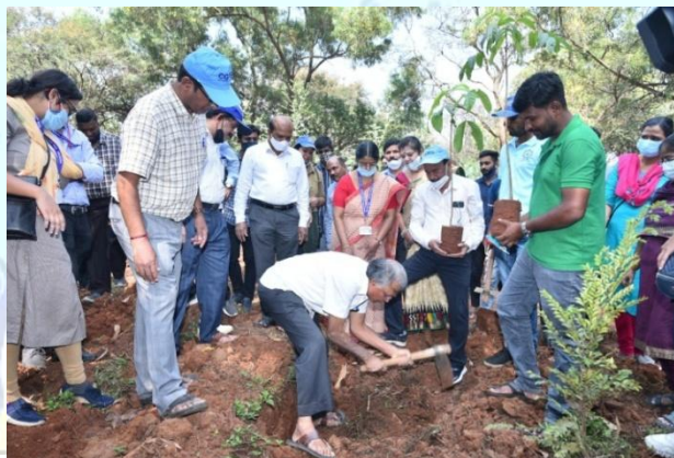
Inauguration of afforestation Activity by Vice-Chancellor, Bangalore University