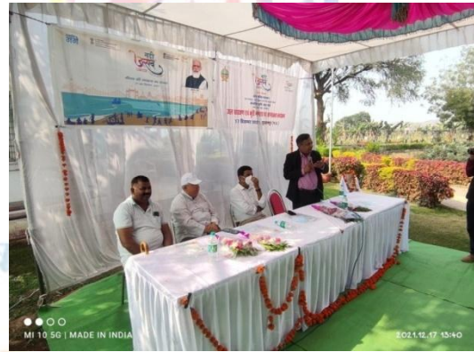
कार्यक्रम में उपस्थित छात्र छात्राओं द्वारा संवाद