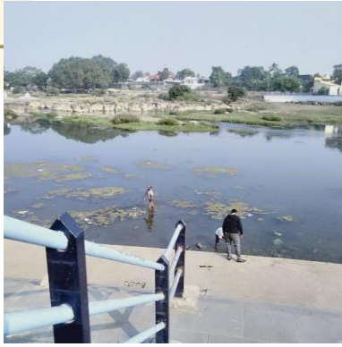
Before the cleanliness drive at Dham river