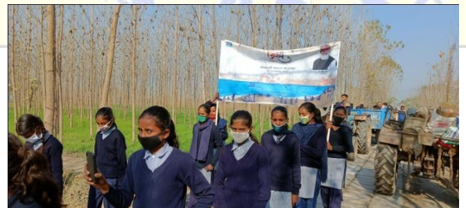
Rally walk by the students upto Yamuna river