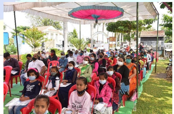
क्षेत्रीय निदेशक महोदय का जल संरक्षण एवं कुंडी भंडारा पर तकनीकी संबोधन