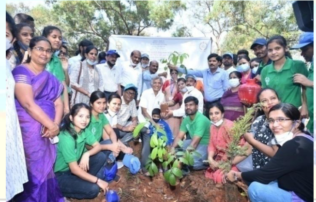
Participants of afforestation activity