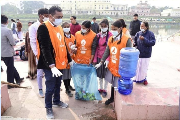
कार्यक्रम के दौरान सूखे कचरे की सफाई