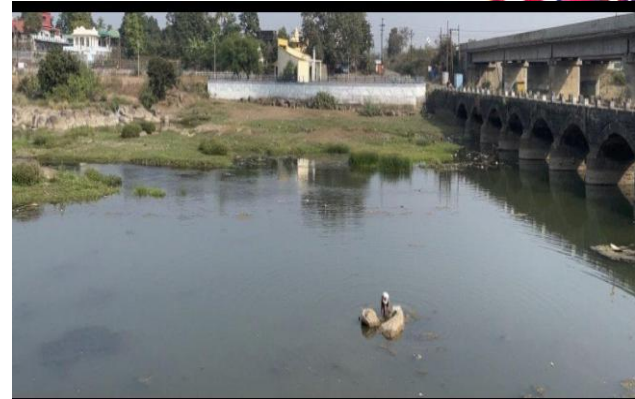
After the cleanliness drive at Dham river

2. Nadi Puja- After cleanliness drive, priest along with other dignitaries and local people conducted the Nadi Puja with lighting of lamps/ diyas at Dham river.