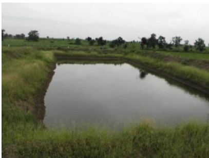
Excavated/dugout farm pond